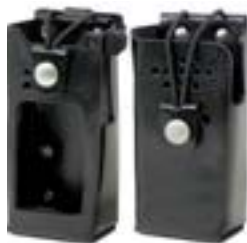
Leather Holsters For RDR2500 / RDR2550 / RDR2600