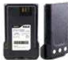
Battery Pack B2618LI Lithium-Ion 7.4V 1800mAh 13.32 Wh