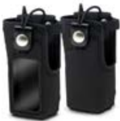
Nylon Holsters For RDR2500 / RDR2550 / RDR2600