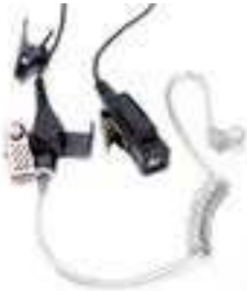
One-Wire Surveillance Kit In-Ear Style SK12NE-X03S