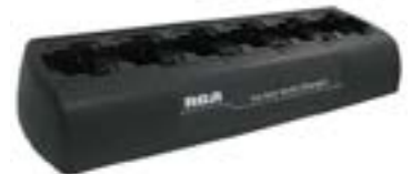
6 Bank Charger CHU6 - RDR2500 cup