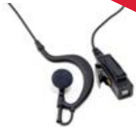
One-Wire Surveillance Kit Ear Hook Style SK12EH-X03S