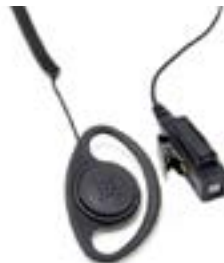
One-Wire Surveillance Kit D-Loop Style SK12DL-X03S