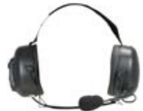
Heavy Duty Behind the Head Headset HS65NR-X03S, HS75NR-X03S