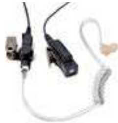
Two-Wire Surveillance Kit In-Ear Style SK22NE-X03S