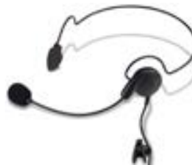
Light Duty Behind the Head Headset HS12V-X03S